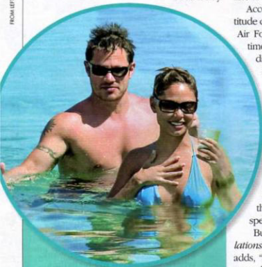
A pal of Nick tells OK! the singer likes Vanessa because she's down to earth.

such high-profile men as actor Orlando Bloom , J.Lo's ex, Cris Judd , and New York Yankees captain Derek Jeter . Vanessa began dating the sports superstar in 2003 and ended the relationship only after she started to get serious with Nick. And some in the Yankees circle were glad to see her go. A source tells OK! , "A lot of the wives and girlfriends of the Yankees players didn't think Vanessa fit in with them. She was a tomboy and they told Derek she was kind of crass and should tone it down."